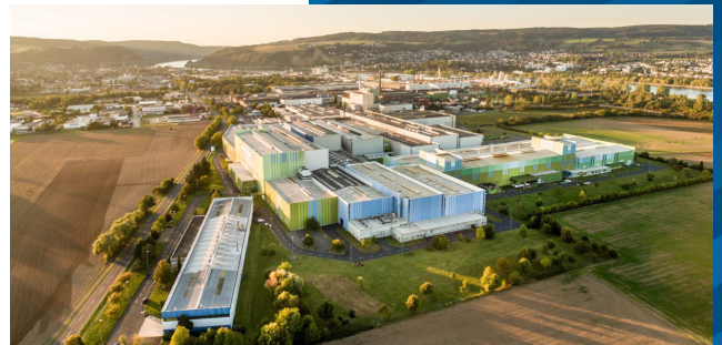
thyssenkrupp, Andernach Germany