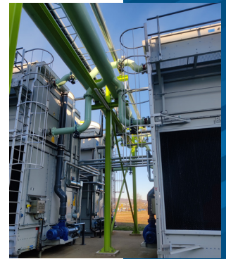
Easy and safe access to the top of the unit via the ladder, cage and platform