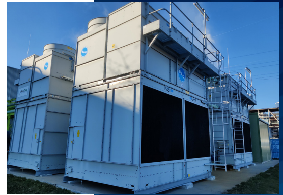
(4) FXVS 1218C-32Q-P